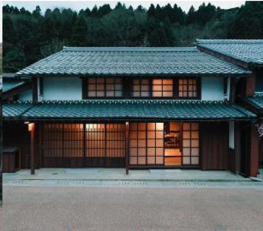
Tsugumi and Hibari; 3 and 5 guests respectively