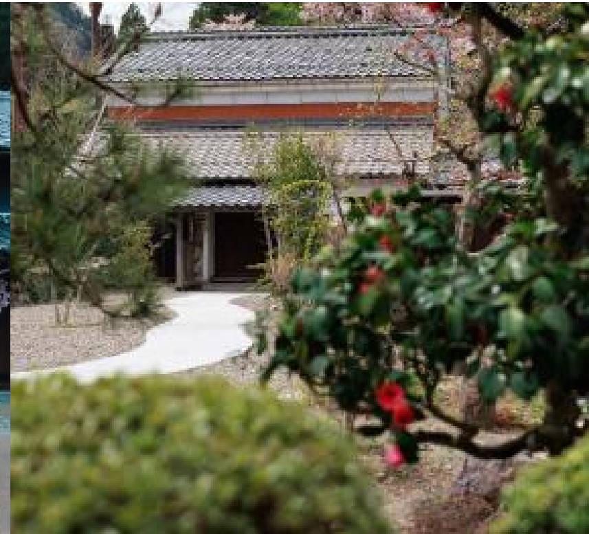
Yamane; 5 guests