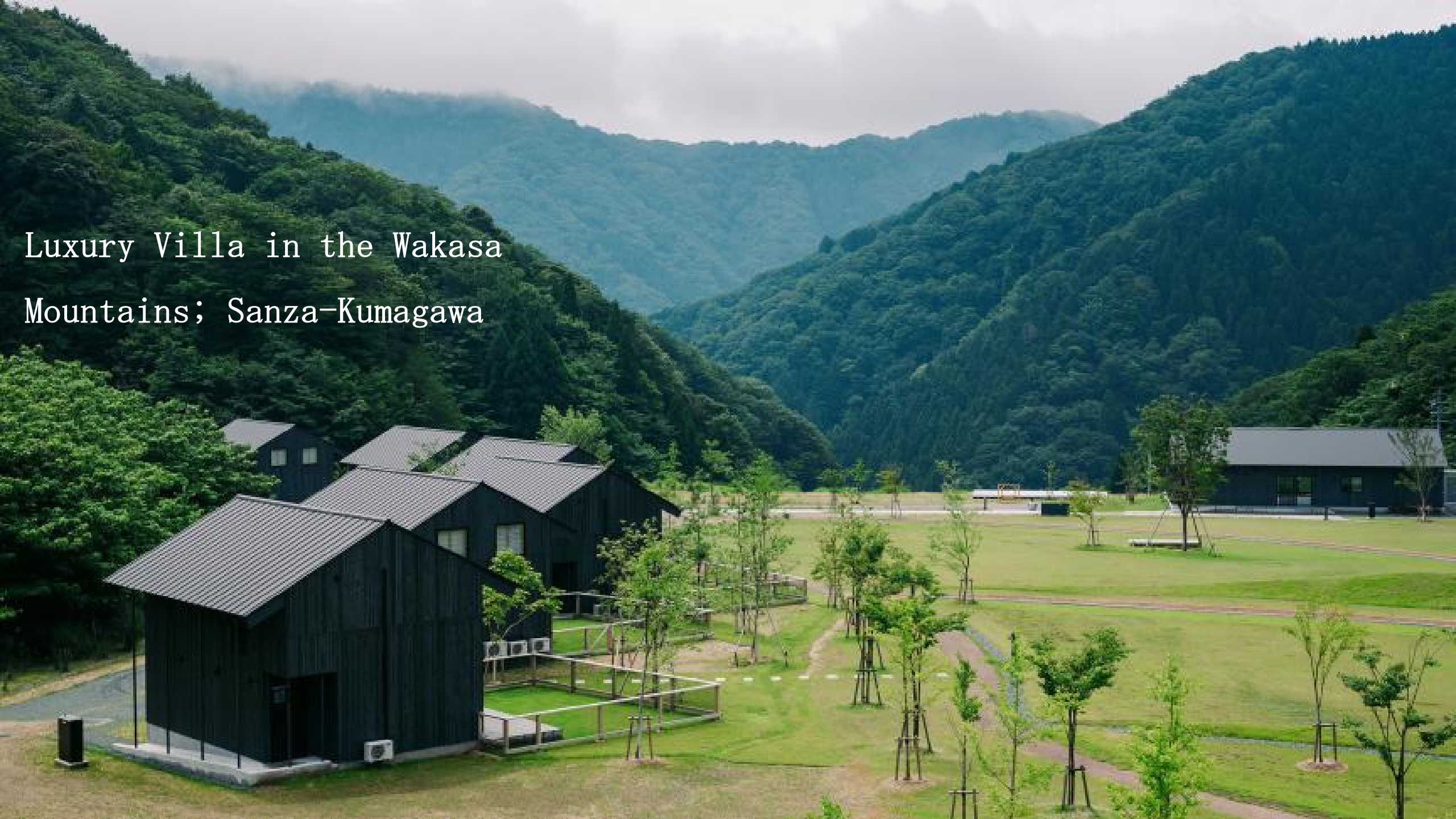
Luxury Villa in the Wakasa Mountains; Sanza-Kumagawa