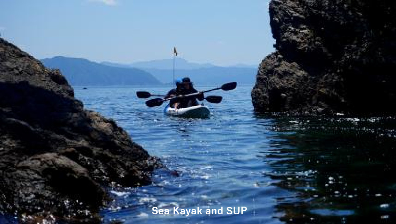
Sea Kayak and SUP