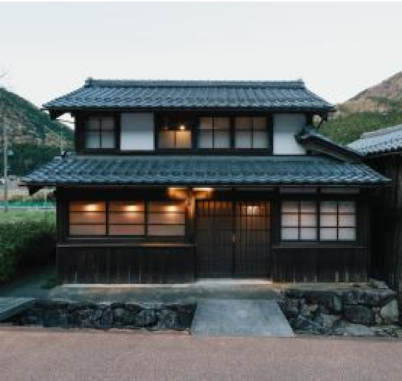
Hotaru, 3 guests

3 renovated homes. You rent the entire building, not just a room.