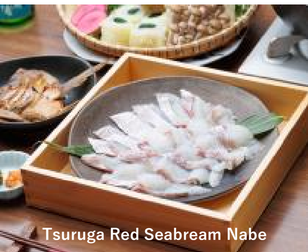
Tsuruga Red Seabream Nabe