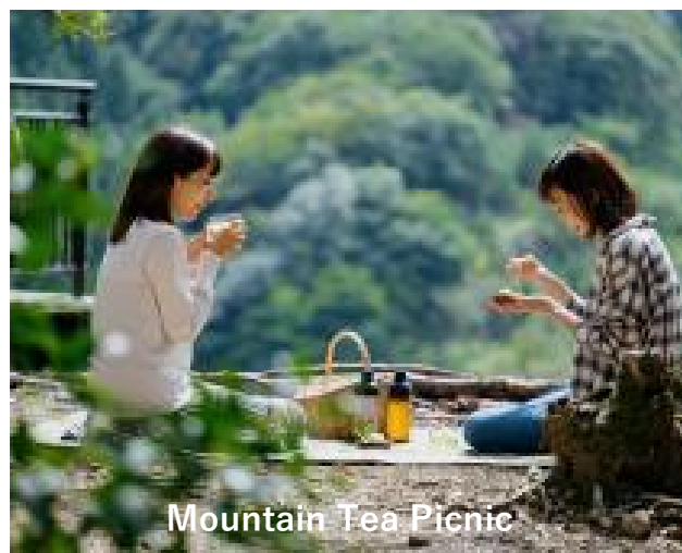
Mountain Tea Picnic